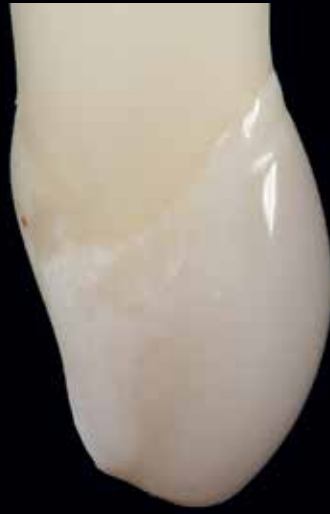
Luted CL — mesial view