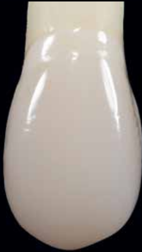
Luted CL — buccal view