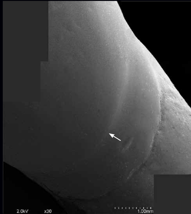
SEM after luting