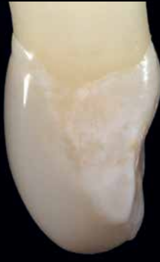
Luted CL — distal view